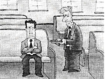
SEVENTY TWO LONG HOURS LATER AND STILL THE STANDOFF CONTINUED ....